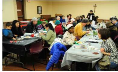
gathering in celebration of Black History Month.

Last Sunday's Hospitality Sunday featured a Soul Food Bruch enjoyed by parishioners and friends. Thanks to all who made possible this