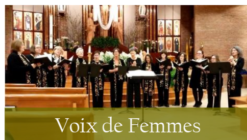
Lenten Concert of Women's Voices – As we enter this reflective time of the year, composers such as

Stations of the Cross – The Via Crucis is a journey made in the Holy Spirit, that divine fire that burned in the heart of Jesus and brought him to Calvary. The Stations of the Cross in the form adopted by Pope John Paul II are prayed in English on Fridays of Lent at 6pm, followed by a Simple Lenten Meal, and in Spanish on Sundays of Lent at 2:15pm. Join us for this beautiful devotion, so fitting for Lent.