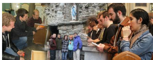
Lenten Lecture Series – Join us for the first session of our

Choral Highlights – The Office of Music Ministries resumes its Choral Highlights feature (website front page) that describes the upcoming Sunday's choral works and their relationship to the readings and Mass prayers, with digital versions of several works for your listening pleasure and inspiration during these weeks of Lent. Enjoy!