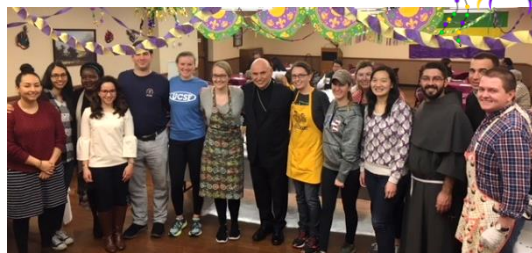
Great food, fun and fellowship at the Cathedral Young Adults Mardi Gras Pancake Breakfast!

Please help us get the word out by sharing copies with family, friends and co-workers.