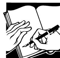
RITE OF ELECTION

Candidates! – Last Sunday our RCIA catechumens and candidates were presented to Cardinal Wuerl