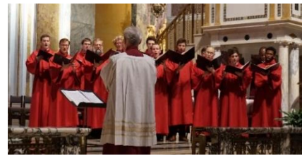
the Fourth Sunday of Lent.