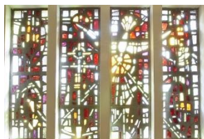
Window in Cathedral Baptistry

... The Spirit of truth and charity reminds us of everything that Christ said, he makes us enter ever more deeply into the meaning