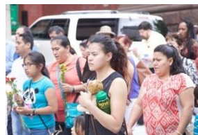
Procesión del Corpus Christi, 29 de mayo de 2016 Para ver más fotos, visiten el Facebook de la parroquia .