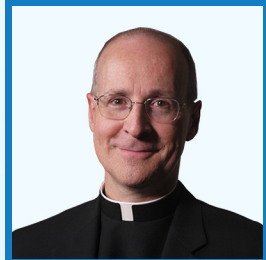
Fr. James Martin S.J.