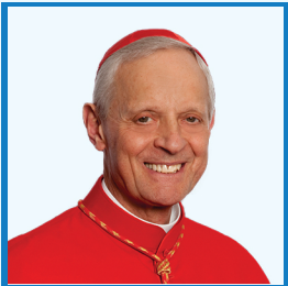
Cardinal Donald Wuerl

A one-day World Youth Day experience for young adults (18-39) in Washington, D.C. Visit Washington. Experience Krakow. Encounter Christ.