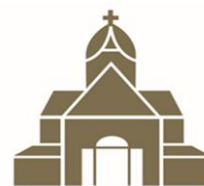
St. Matthew's Cathedral

Sign Up: To register to walk or to make a donation, please visit: www.unbounddc.org . Our team's name is "St. Matthew's Cathedral"