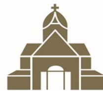
St. Matthew's Cathedral

Sign Up: To register to walk or to make a donation, please visit: www.unbounddc.org . Our team's name is "St. Matthew's Cathedral"