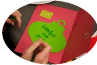
Card signing, gift wrapping and refreshment and fellowship for all at December hospitality receptions