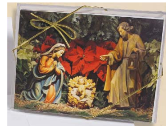
St. Matthew's Crèche - Christmas cards available in boxed sets of 10 cards & envelopes

Also available are sets of six note cards picturing the art of the Cathedral, boxed sets of ten Christmas cards featuring St. Matthew's Crèche, Christmas ornaments and several CD recordings of the Cathedral's Schola Cantorum . CD titles are listed on our website.