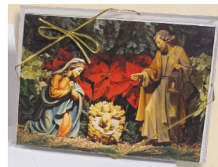
St. Matthew's Crèche - Christmas cards available in boxed sets of 10 cards & envelopes

Also available are sets of six note cards picturing the art of the Cathedral, boxed sets of ten Christmas cards featuring St. Matthew's Crèche, Christmas ornaments and several CD recordings of the Cathedral's Schola Cantorum . CD titles are listed on our website.