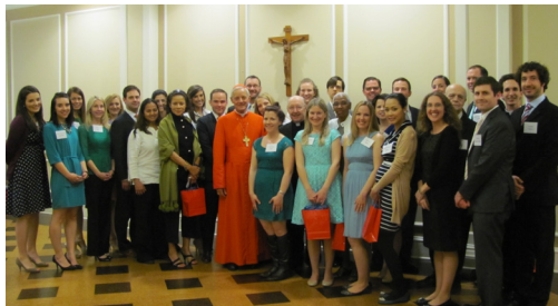
St. Matthew's 2013 RCIA Class with Cardinal Wuerl