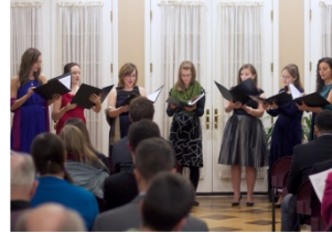
Women of the Schola, December 2013

CHAMBER MUSIC CONCERT – Ensemble 42, a DC-based wind-strings chamber music ensemble, will perform Johannes Brahms' youthful Serenade No. 1 on Sunday, March 2 at 7pm, following the 5:30pm Mass. The piece, which Brahms later rearranged for a larger orchestra, bursts with the energy and passion of the young Brahms,